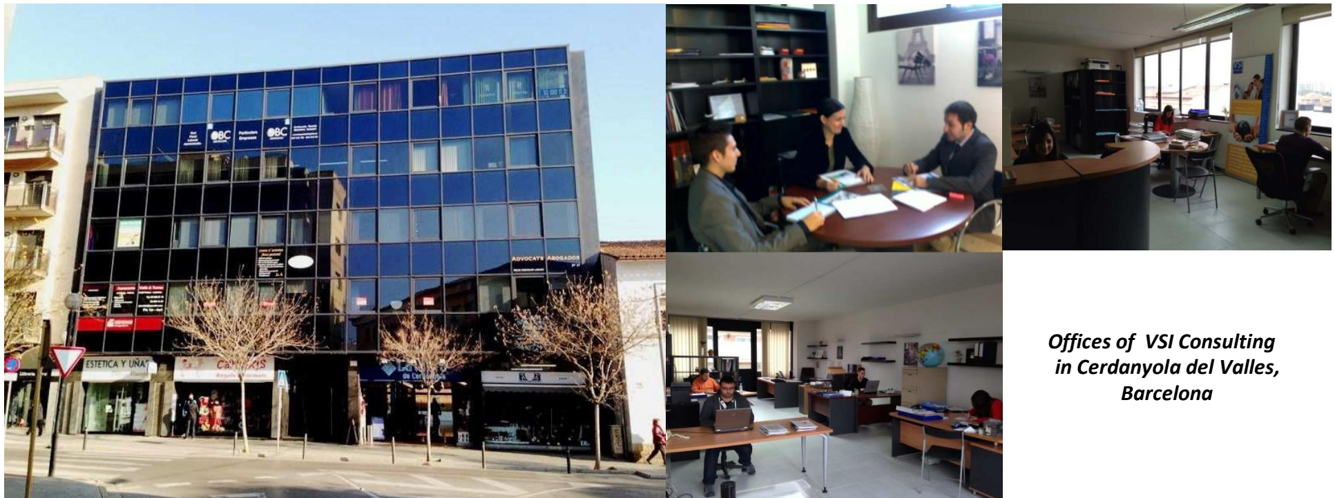
Offices of VSI Consulting in Cerdanyola del Valles, Barcelona

The team of professionals that make up VSI in Spain has more than 20 years of experience in international trade and our network of delegations abroad (more than 40 markets) are highly qualified professionals, with extensive professional careers and recognized experience in support to the internationalization of Spanish SMEs. VSI has 16 people in Spain and more than 100 in the world.