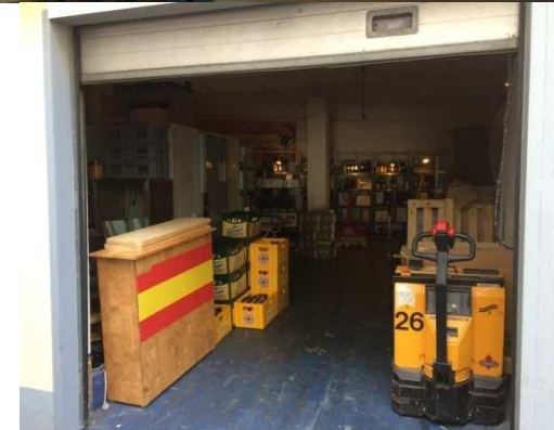
Offices, warehouses and show room in GERMANY